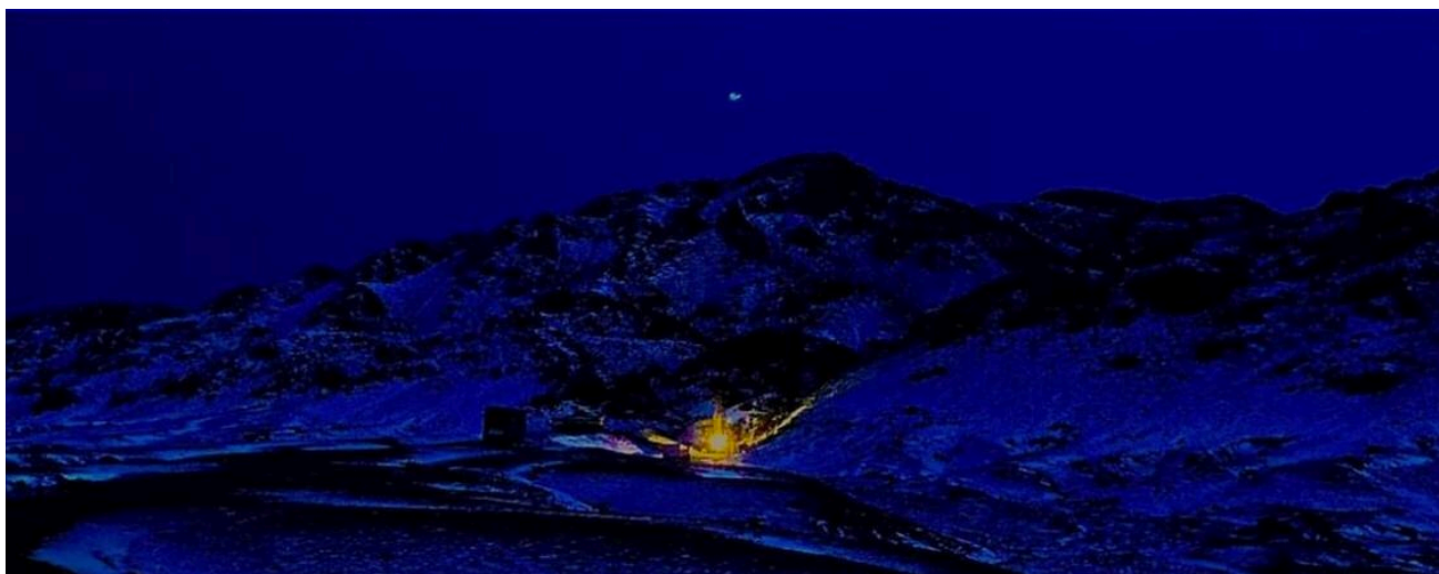
Yangir 1S in the Gobi night

The Yangir 1S strat-hole well has been terminated at just over 347 metres and the site has now been remediated. The drilling of the well suffered from various mechanical problems which, despite a number of different efforts, could not be remedied due to recent COVID related restrictions imposed on the movement of equipment and people in Mongolia.